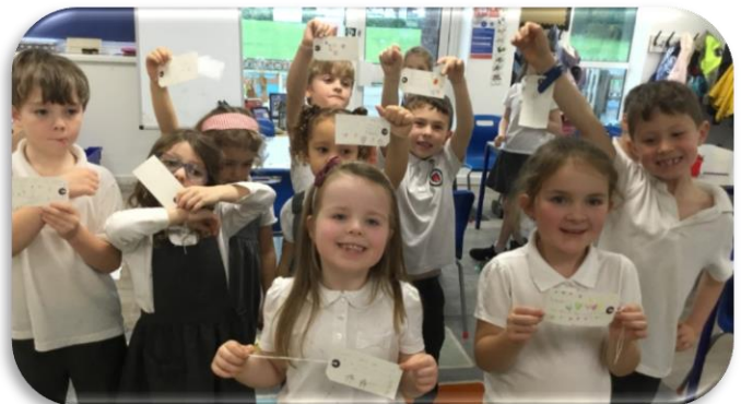
Growing Together, Belonging and Achieving